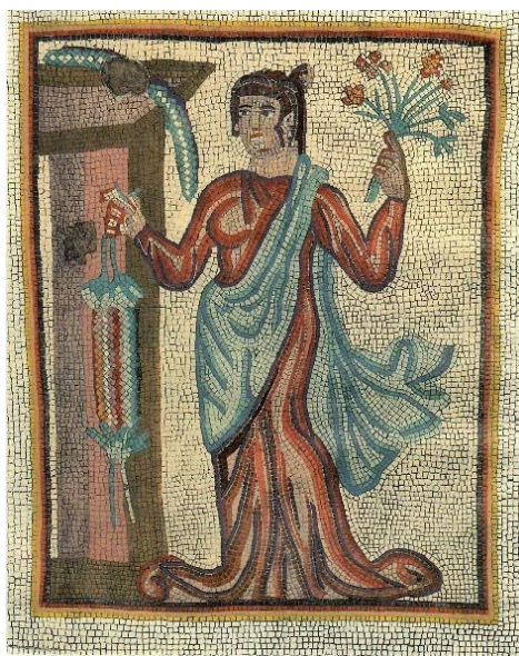
Fig. 7 & 8

in pairs, have similarities and of course, slight dissimilarities that have never been noticed. The most important dissimilarity of these musicians is in their necklaces and even the decoration on their lace dress (see later) two by two. Two of them have a lace dress with the same decoration. Two dancer-musicians have a simple necklace (pearl) and the other two have a necklace with a hanging flower form (small pendant) on the neck. Both of these forms of necklaces (simple and with pendants) are known in Sasanian art (i.e. Kartir, Sasanian kings, dancers). An eagle-shaped nose is very much like two people (at least) as if they were members of the same family!